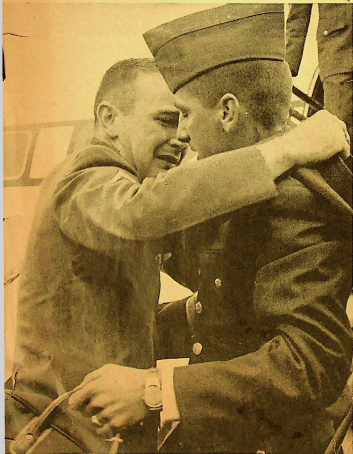
Another survivor gets an embrace from his brother, who burst into tears at the reunion after the crash.

have the strength. Then he grabbed my arms and somebody else pulled me in by the seat of my pants.