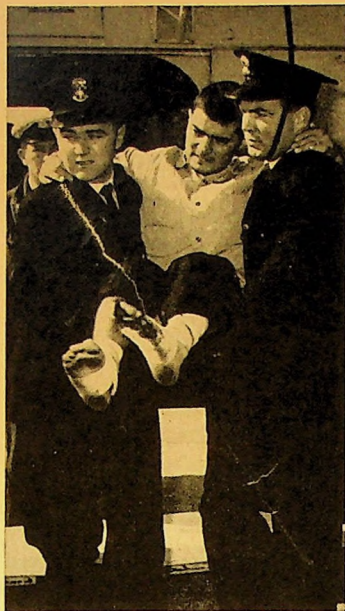
One injured survivor had to be carried to a hospital in Ireland.